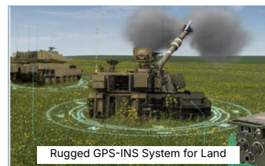
Rugged GPS-INS System for Land

The unit is suited for combat platforms where power reliability is directly tied to mission continuity. It supports systems that must remain accurate and operational during vehicle motion, shock, vibration, recoil, extreme temperature, and high-EMI environments. With 17 regulated outputs, fast startup, fault monitoring, and built-in protection features, the LVPS provides a compact power foundation for integrated military electronics.