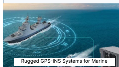
Rugged GPS-INS Systems for Marine